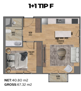
CAMPAIGN PRICE FOR TWO UNITS: 407.000 USD